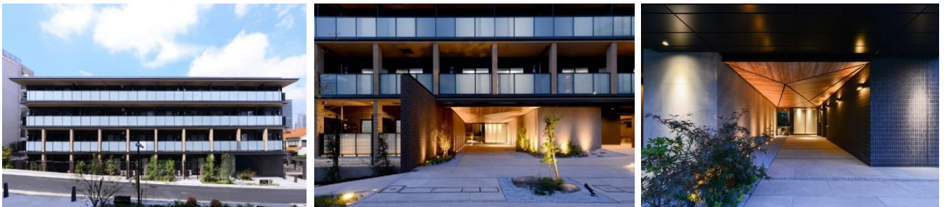
Condominium [Harmony Residence Shinjyukugyoen The West. The East]