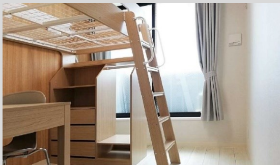
Private rooms equipped with furniture