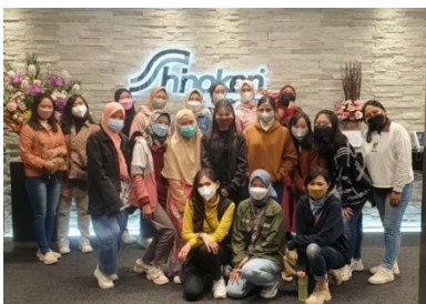
(Arrived in Japan)

In order to help people from Indonesia to get used to Japan as quickly as possible and to feel safe and comfortable, we constructed a warm wooden dormitory with private rooms, prayer rooms, community space, etc.