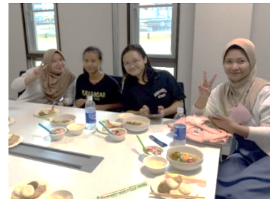
(The staff in Osaka)

Our Group will continue to train nursing care personnel and enhance its nursing care services.