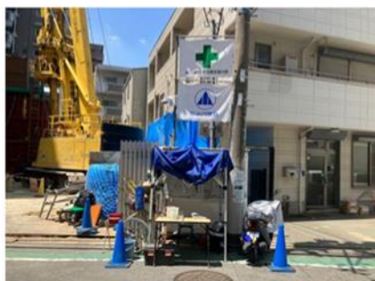
Salt Tablets & Oral Rehydration Solution

We have installed water coolers and ice machines to ensure that cold drinks are always available. We also distribute oral rehydration solutions (OS-1) and salt tablets.