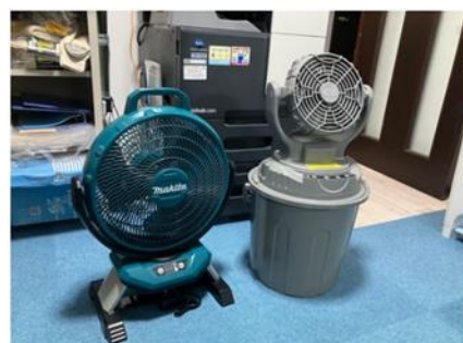
Rechargeable Mist Fan

These initiatives are based on the belief that creating a safe and healthy working environment for employees in the construction field, is the foundation that supports the Group's overall business activities.