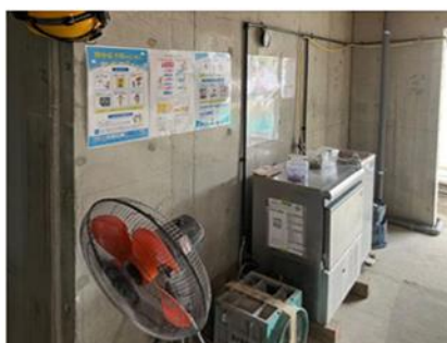
Ice Machine & Water Cooler